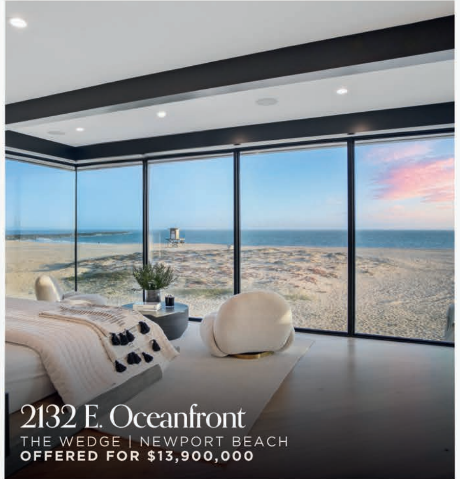
2132 E. Oceanfront THE WEDGE | NEWPORT BEACH OFFERED FOR $13,900,000