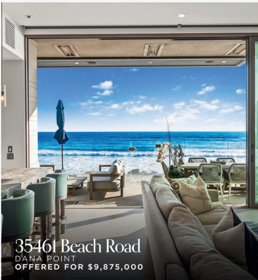
35461 Beach Road DANA POINT OFFERED FOR $9,875,000