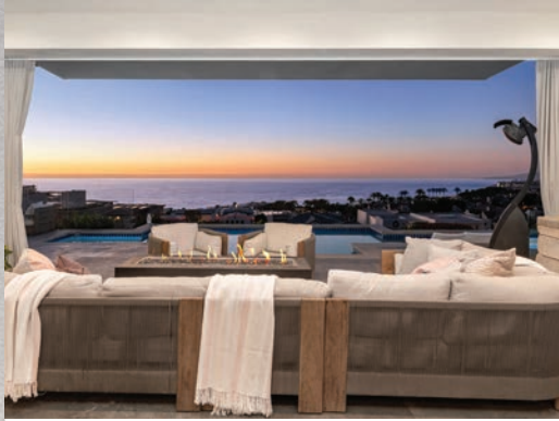
DANA POINT The Strand