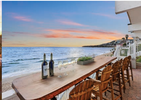
LAGUNA BEACH Offered at $24,950/Month