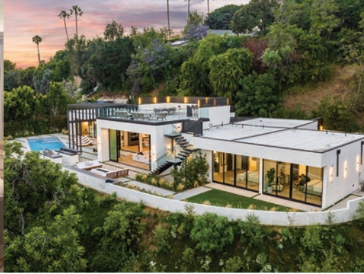
BEL AIR Just Sold