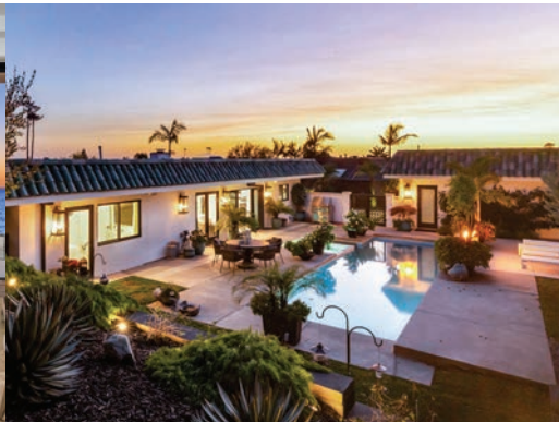
DANA POINT Just Sold