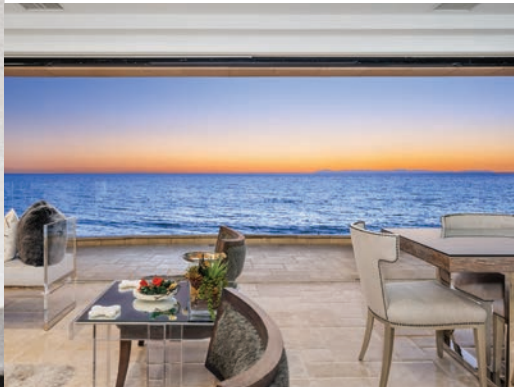
LAGUNA BEACH Offered at $79,438/Month