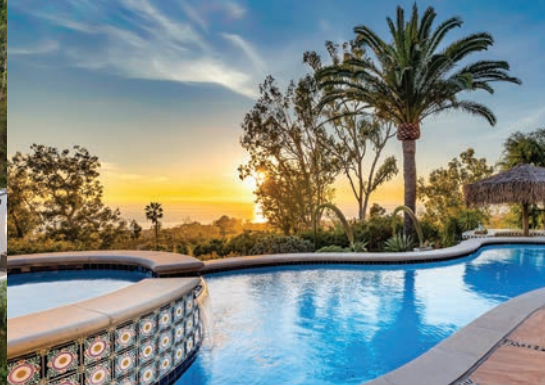
LAGUNA BEACH Listed at $6,298,000