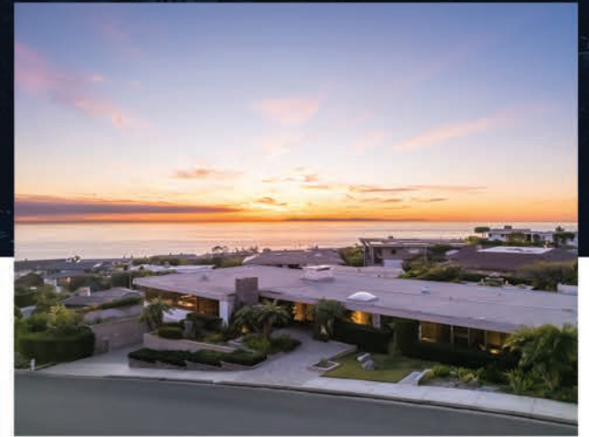
32621 BALEARIC ROAD, DANA POINT $6,995,000 | Midcentury lines and vast vistas 4 BEDROOMS, 3 BATHROOMS, 2 POWDER ROOMS