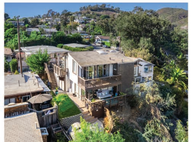
134 HIGH DRIVE, LAGUNA BEACH $2,995,000 | Fully approved plans in North Laguna 3 BEDROOMS, 2 BATHROOMS