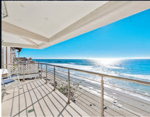
1051 GAVIOTA DRIVE, LAGUNA BEACH $7,995,000 | Triplex with private beach access 4 BEDROOMS, 3 BATHROOMS, 1 POWDER ROOM