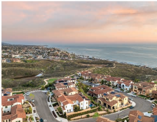
101 VIA ALMODOVAR, SAN CLEMENTE $5,695,000 | Ocean views in Sea Summit 5 BEDROOMS, 5 BATHROOMS, 1 POWDER ROOM