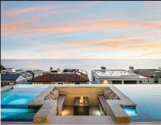
7 PACIFIC WAVE CIRCLE, DANA POINT $15,495,000 | New construction in The Strand 6 BEDROOMS, 6 BATHROOMS, 2 POWDER ROOMS