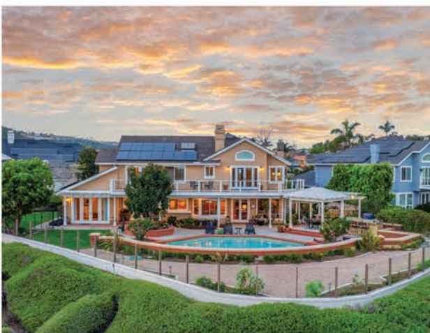
44 NEW HAVEN, LAGUNA NIGUEL $4,995,000 | 180-degree sit down ocean views 4 BEDROOMS, 4 BATHROOMS