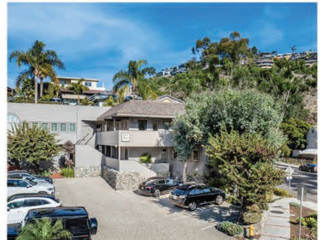
410 BROADWAY STREET, LAGUNA BEACH $5,495,000 | Exceptional commercial opportunity APPROX. 5,300 SF BUILDING