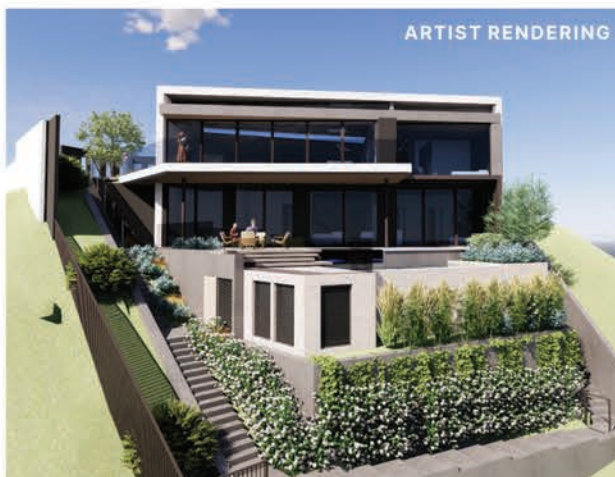
1223 SKYLINE DRIVE, LAGUNA BEACH $3,495,000 | Corner lot with DRB-approved plans 3 BEDROOMS, 2 BATHROOMS