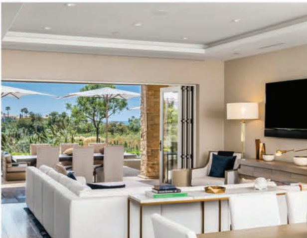
51 MONARCH BEACH RESORT SOUTH, DANA POINT $6,799,000 | RH Interiors and guard gated community 3 BEDROOMS, 3 BATHROOMS, 1 POWDER ROOM