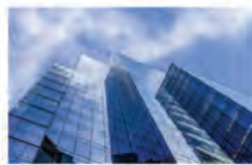
OFFICE / BUSINESS CENTERS