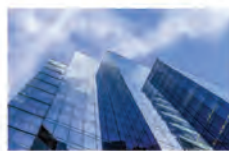
OFFICE / BUSINESS CENTERS