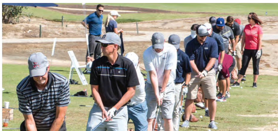
Golfers at Orange County Rescue Mission's Golf for Hope warming up for a fun day ahead