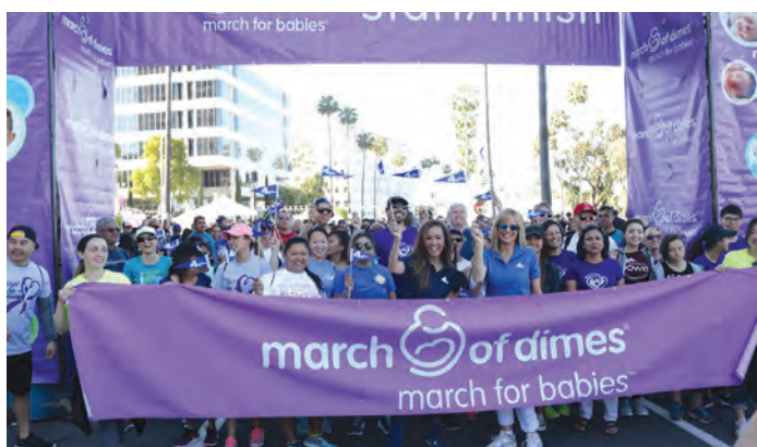
Walkers and runners at the starting line of March for Babies