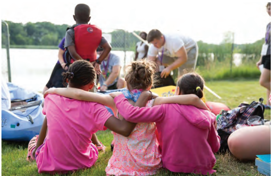
Royal Family KIDS creates life-changing moments for foster children ages 6-12. Our vision is to serve every child eligible for our Camp and Mentoring Club programs