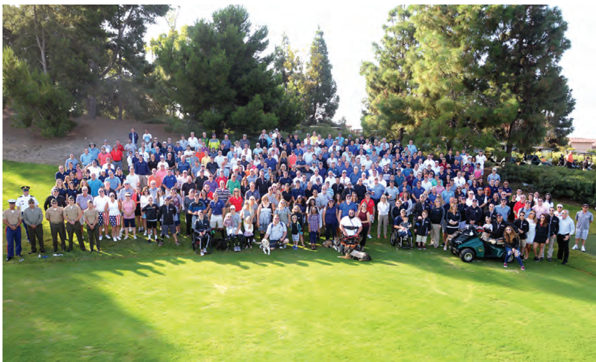
Veterans, CCF donors, distinguished guests and Carrington associates assembled for the opening ceremony