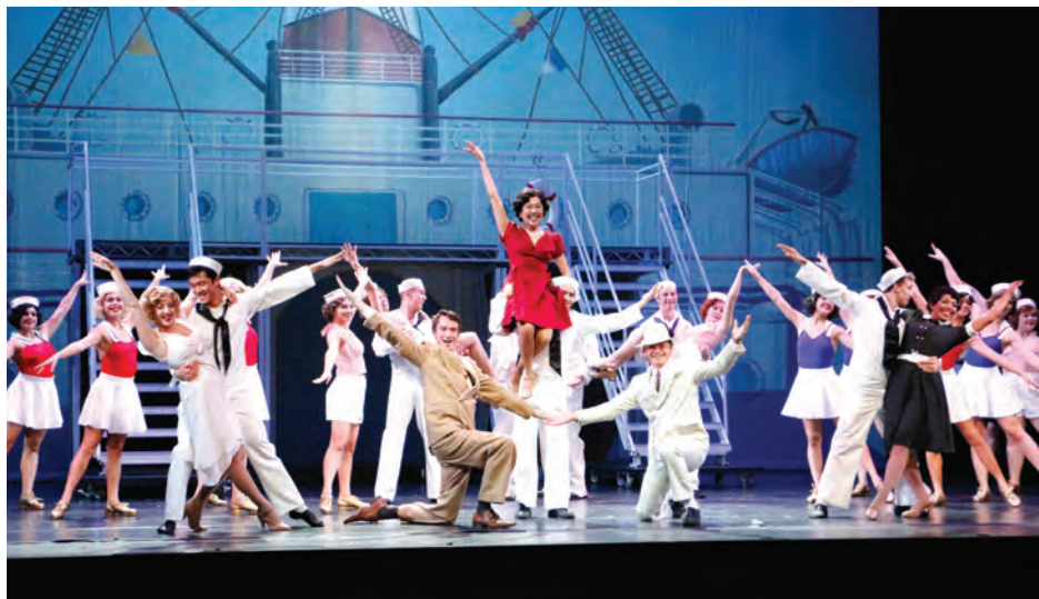
Chapman Celebrates features a cast of more than 100 talented Chapman students