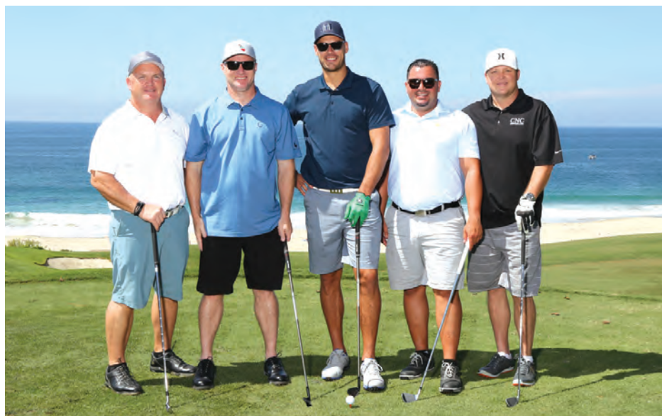
Captain of the Anaheim Ducks, Ryan Getzlaf, hosts the Getzlaf Golf Shootout in 2017 benefiting CureDuchenne