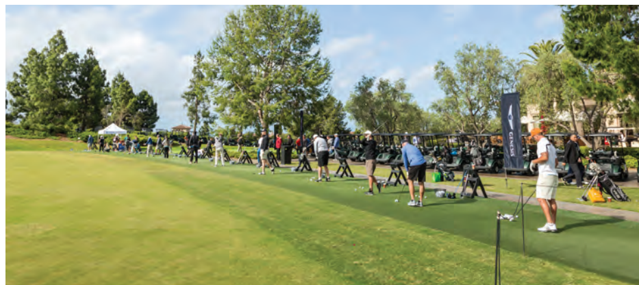
CHOC golfers getting ready to tee up at the CHOC Children's Classic