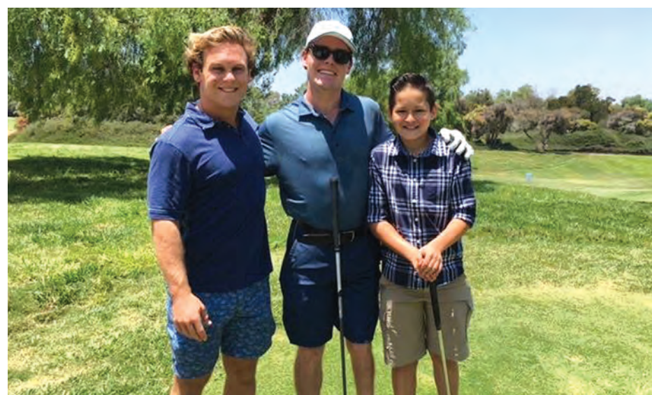
JDRF Youth Ambassadors at the 2017 Fore the Kids Golf Classic