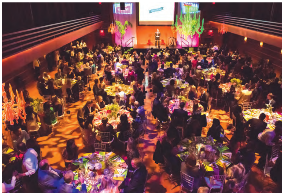
Proceeds from the Arts & Business Leadership Awards Dinner help support the Segerstrom Center for the Arts' exceptional education and community engagement programs that enrich and transform the lives of over 360,000 students and families each year