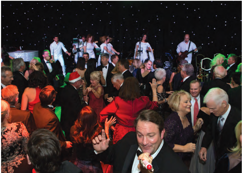
The 51st annual Christmas Carol Ball, hosted by Hoag Hospital Foundation, broke records raising more than $1.79 million in support of Hoag