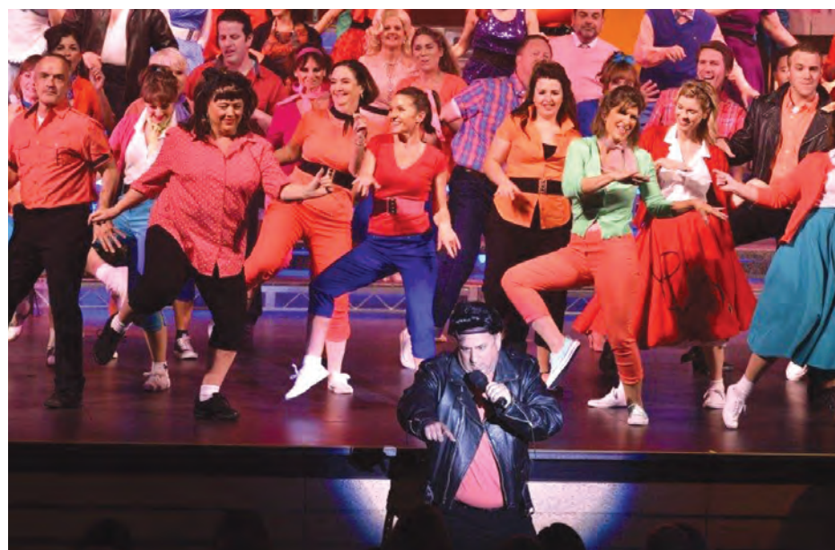
The cast of the 2017 CHOC Follies