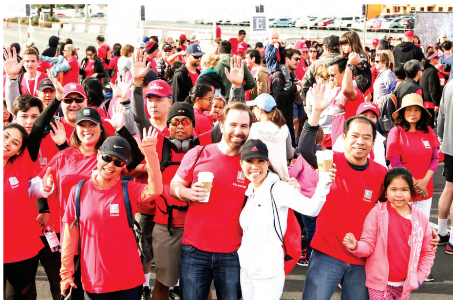
The 2018 Orange County Heart and Stroke Walk will take place at Angel Stadium of Anaheim on Saturday, March 24