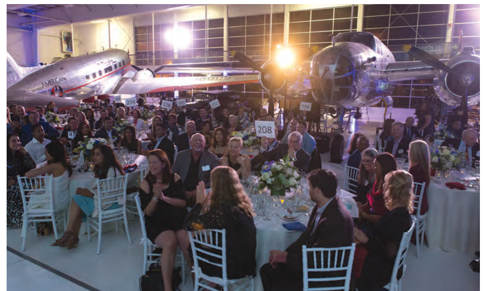
Sage Hill School's 2017 Spring Celebration Take to the Skies