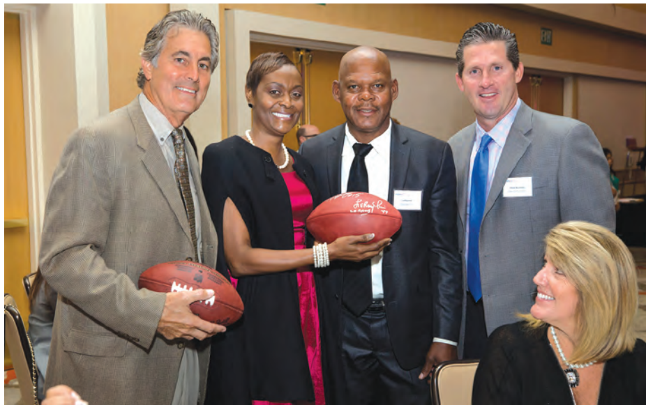
The 2017 United Way Women's Philanthropy Fund Breakfast guests included retired NFL players Vince Ferragamo, LeRoy Irvin & Steve Beuerlein. The keynote speaker was NFL star Michael Oher's adoptive mother, Leigh Anne Tuohy, the inspiration behind the movie The Blind Side