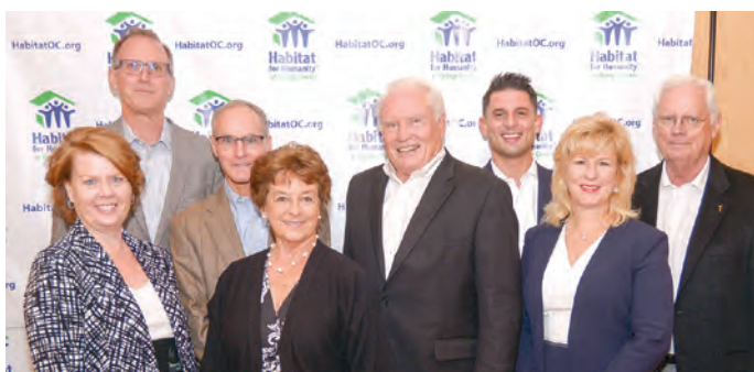
Community Business Leaders attend Habitat for Humanity of Orange County's Building Dreams Fundraising Breakfast to raise funds to support Habitat OC's vision of creating a world where everyone has a decent place to live