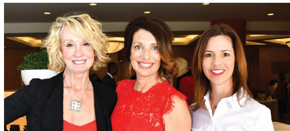
The American Heart Association's 2018 Orange County Go Red For Women Luncheon is scheduled for February 16 at Hotel Irvine