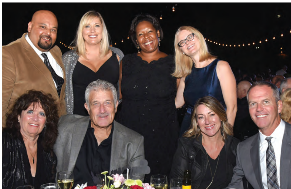
Hope Builders' Best of Friends honoree Brookfield Residential at Light Up A Life 2017