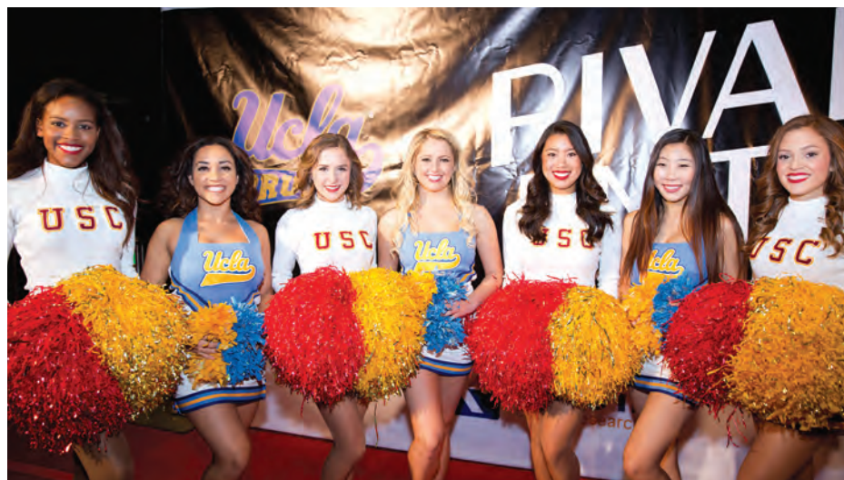
Song Girls from USC and UCLA at Kure It Cancer Research's Rivals Gala

Kure It Cancer Research celebrates its 10-year anniversary with Rivals United For A Kure, The Legacy Continues Gala at The City National Grove of Anaheim. This event raises money for underfunded cancer research while celebrating the rivalry between the USC and UCLA football programs. Kick off Rivalry week as a city divided becomes a city united with a fun-filled evening of dinner, dancing, live music and auction. Proceeds go directly to USC Norris and UCLA Jonsson Comprehensive Cancer Center. For more information or sponsorship opportunities, email jackie@kureit.org or call 949-748-5954.