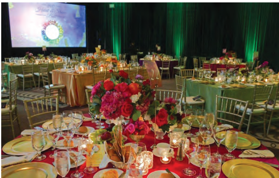
The 2018 Orange County Heart and Stroke Ball is scheduled for Saturday, October 13 at Balboa Bay Resort