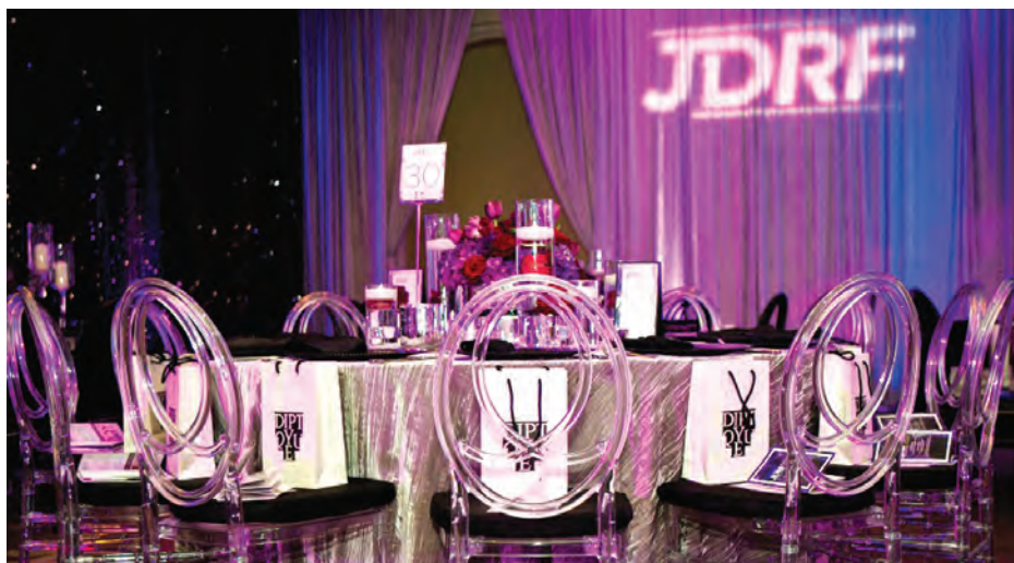
JDRF Dream Gala 2017 – Make Type 1 Disappear