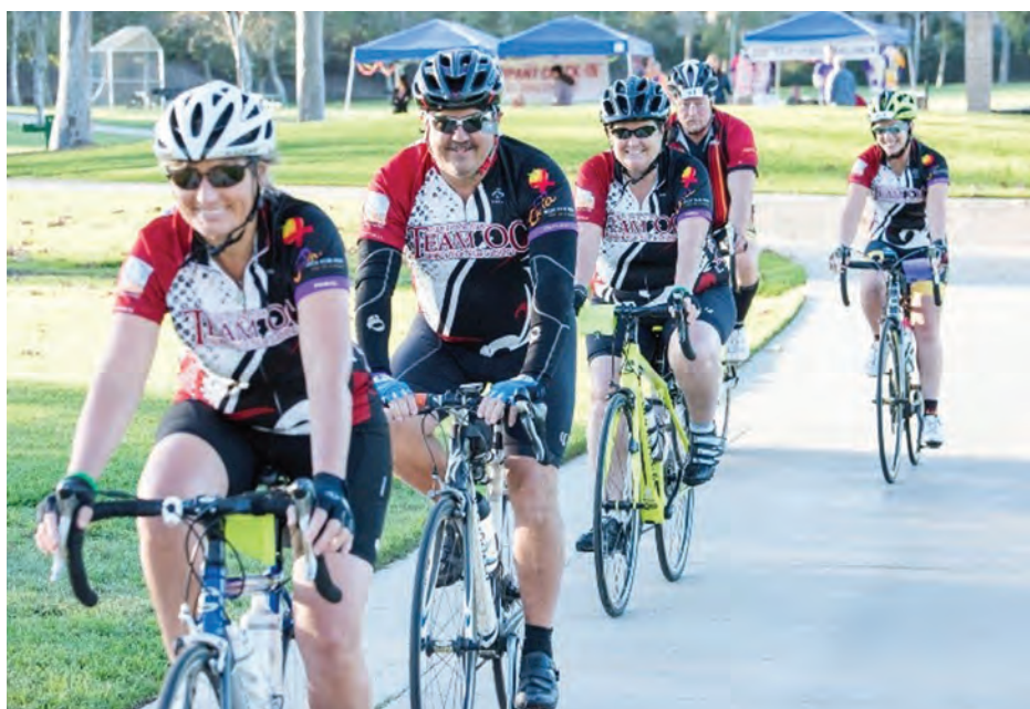
Participants at OC Ride for AIDS riding to raise funds for men, women and children living with or affected by HIV