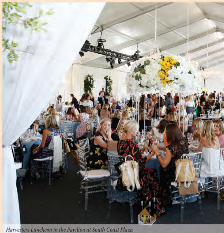
Harvesters Luncheon in the Pavilion at South Coast Plaza