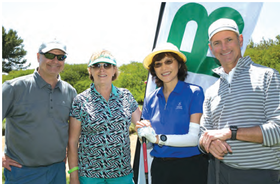
The KidWorks Golf Classic is held annually at the Pelican Hill Resort