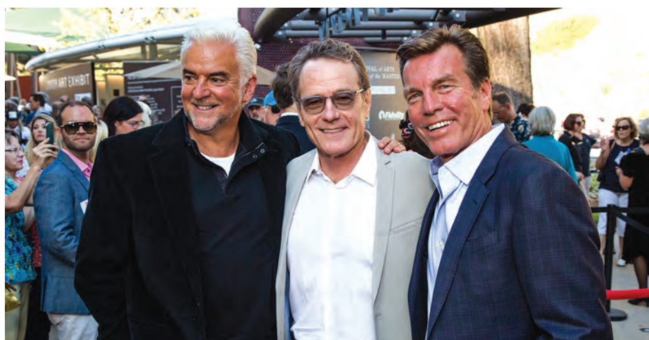
Last year's host actor Byran Cranston (center) with actors John O'Hurley (left) and Peter Bergman (right) at the 2017 Festival of Arts/Pageant of the Masters Celebrity Benefit event