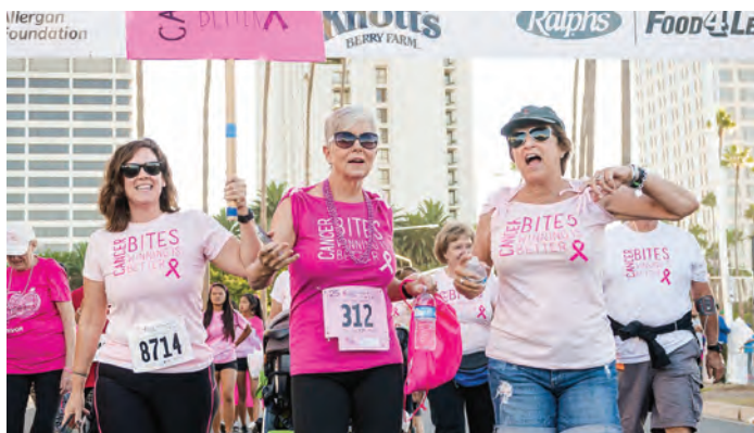
Walkers at the Komen Orange County Race for the Cure

Event Name: Komen Orange County Race for the Cure