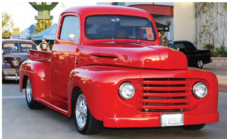
1948 Ford from 2017 Cruisin' For a Cure Event