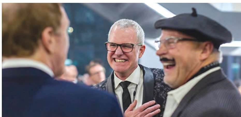
Radiant Health Centers' (formerly ASF) 2017 Annual Gala "An Evening in Paris"