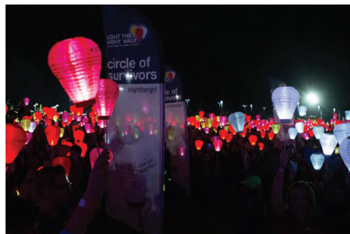
Participants at the Orange County Light The Night Walk

Event Name: 2017 Orange County Light The Night Walk