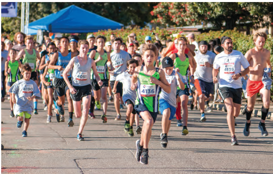
Participants taking off from the start line at Orange County Rescue Mission's fourth annual Turkey Trot OC 5K on November 23, 2017

Come meet Tom the Turkey at the fastest and flattest 5K course in Orange County! Join us on Thanksgiving morning at the Village of Hope in Tustin to raise 30,000 meals for the homeless. Run through Tustin Legacy with up-close views of the historic blimp hangars on this USA Track & Field certified course where you can set a new personal record, support an important cause, and burn off some calories before spending your Thanksgiving celebration with your loved ones. Come out with your friends, family and pets! Visit www.turkeytrotoc.org or call 714-247-4343 for more information.