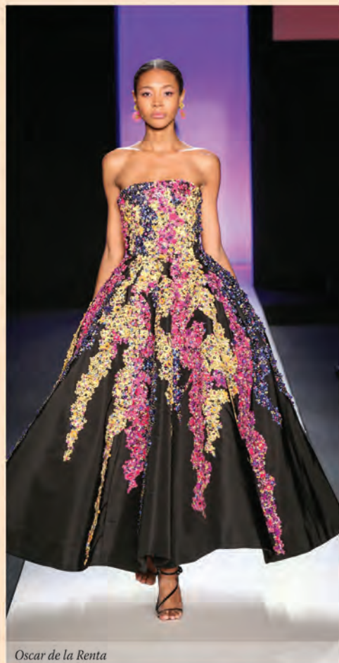
Oscar de la Renta