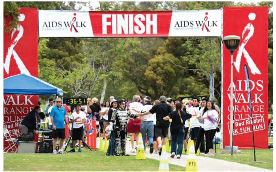
Participants at the finish line at AIDS Walk OC