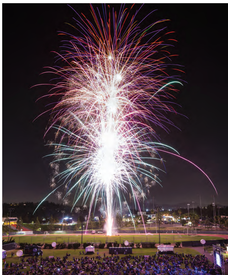
Plan to attend Cal State Fullerton's Concert Under The Stars!