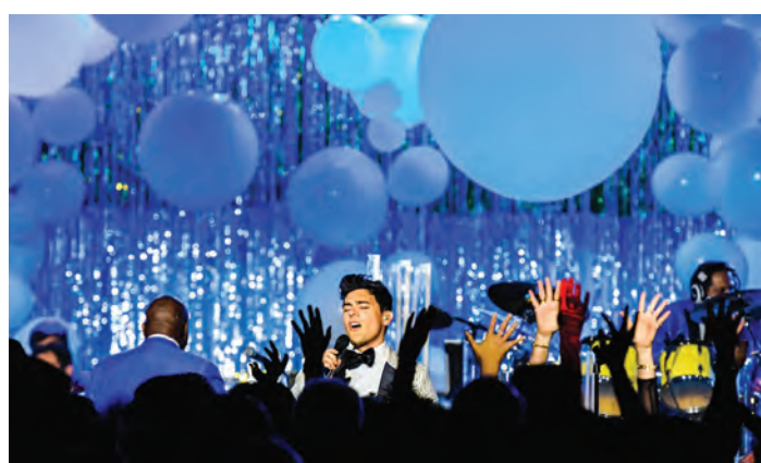
Guests roared their way back to The Jazz Age for a night of flappers and speakeasies to celebrate Pacific Symphony's 2017 Gala

Event Name: Pacific Symphony's 2017 Gala