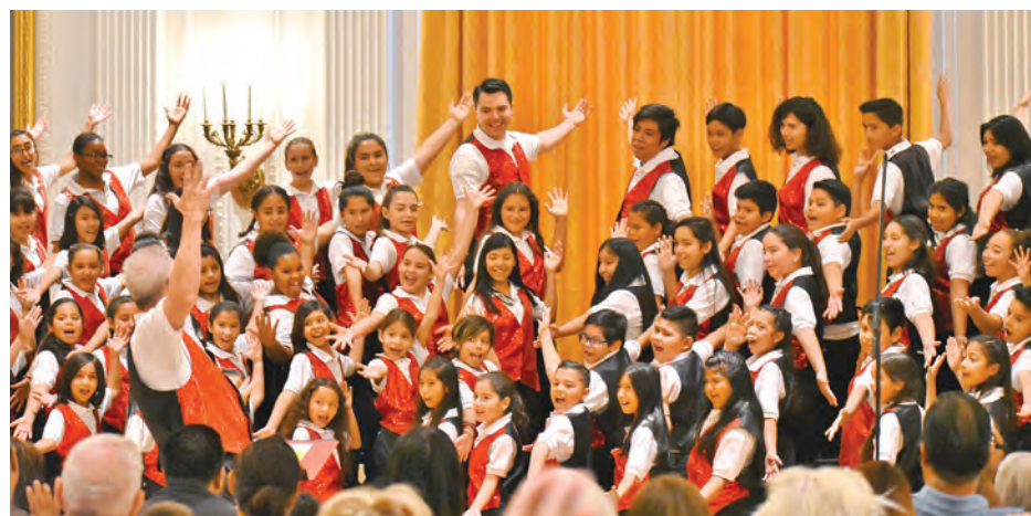
KidSingers in action!