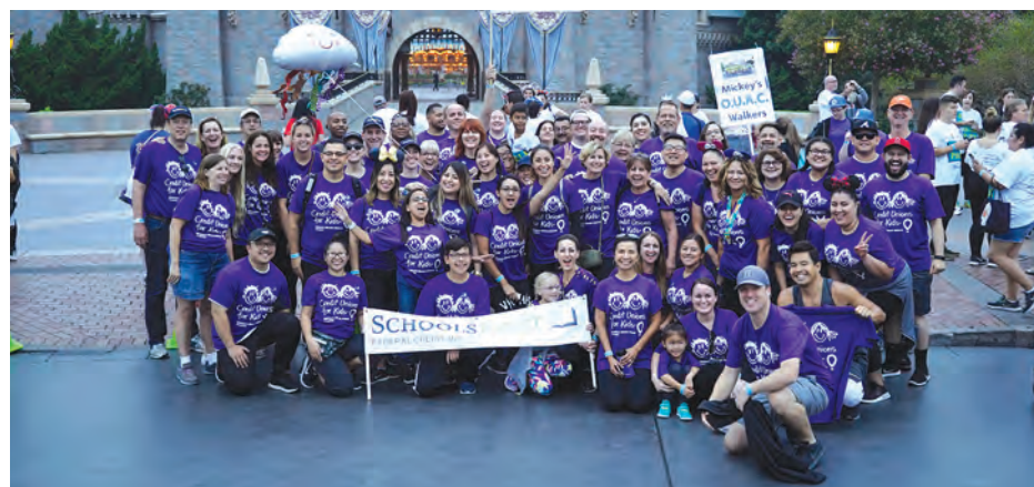
2017 SchoolsFirst Federal Credit Union CHOC Walk Team