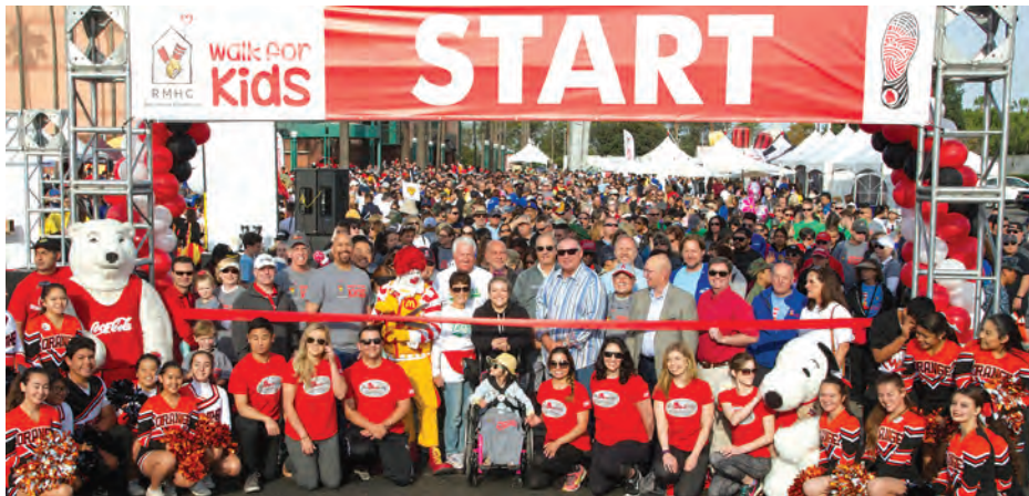
2017 Orange County Ronald McDonald House Walk for Kids with Walk Ambassador Los Angeles Angels Manager Mike Scioscia presented by the Honda Center