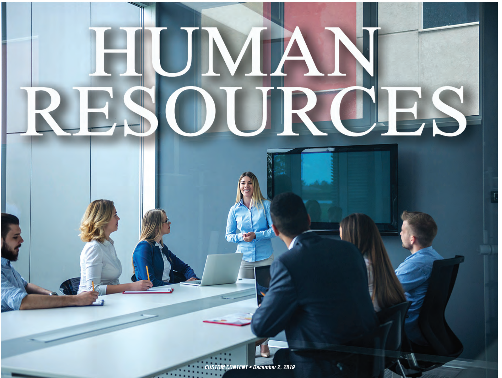
CUSTOM CONTENT • December 2, 2019