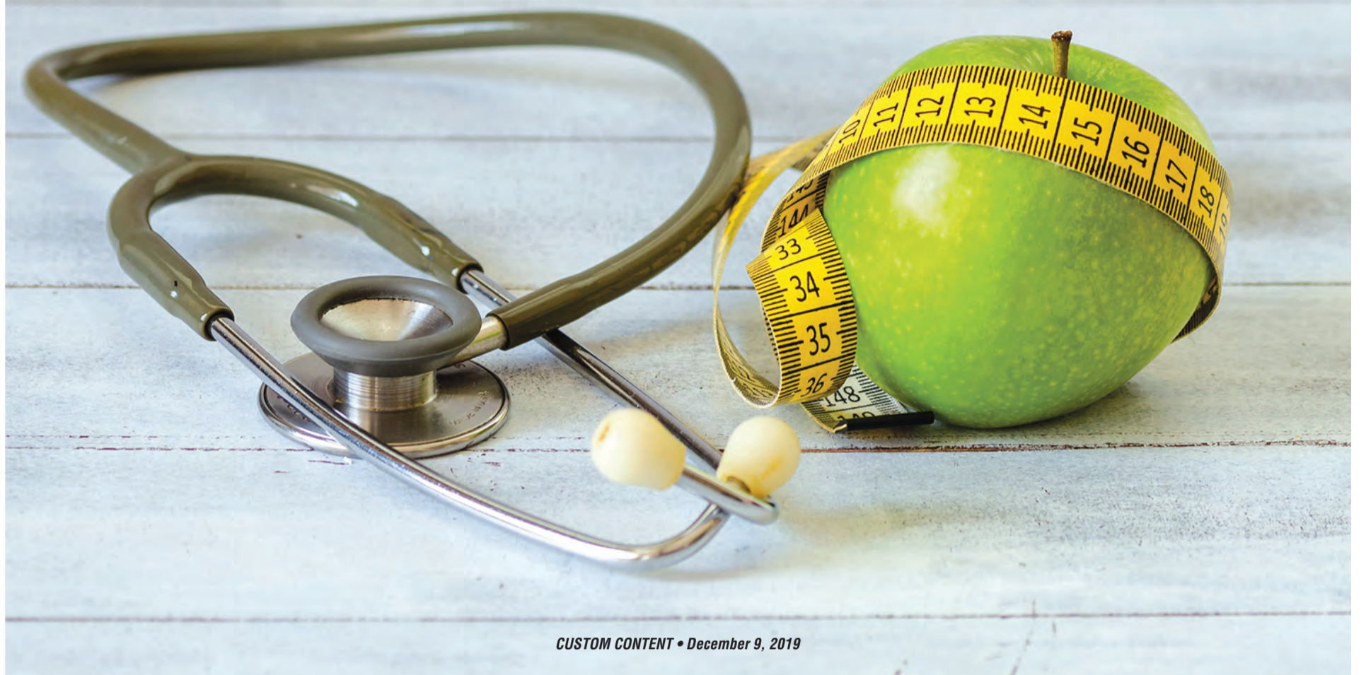
CUSTOM CONTENT • December 9, 2019