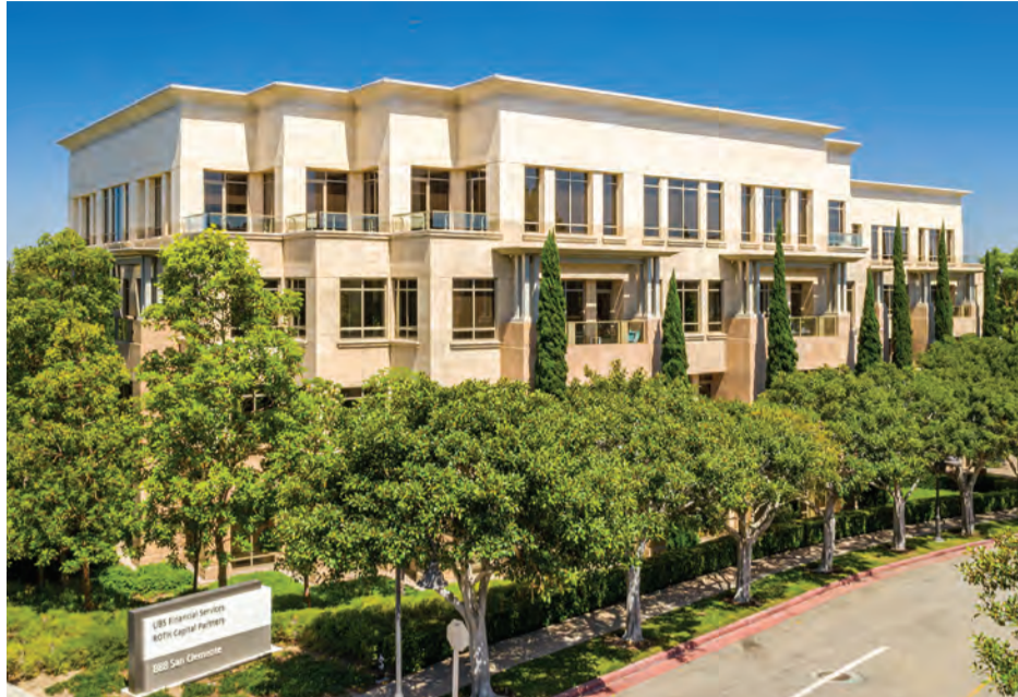
Roth Capital HQ in Newport Center: investment bank retained No. 9 spot, with 60 area brokers

The industry has been sluggish in recent years as investors did their own trading, used robo advisers, or relied on registered investment advisers (see separate story, page 25). While the largest broker-dealers increased their registered representatives last year by